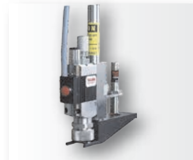
Multi-Orifice Non-Contact Version