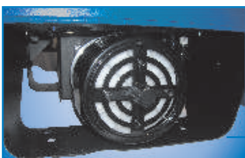
Positive displacement, motor-driven gear pump offers a continuous pulse free output.

D4-E units feature one mechanical relief valve or optional pneumatic relief valve.