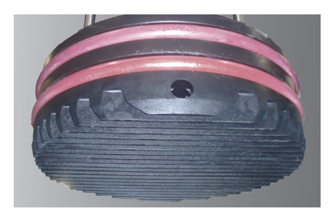
Finned or flat platens better adapt to various adhesive types. All platens are Teflon® coated and include cast-in heaters.