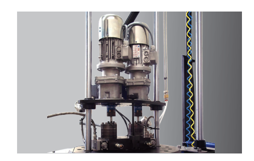
Dual pump in option.